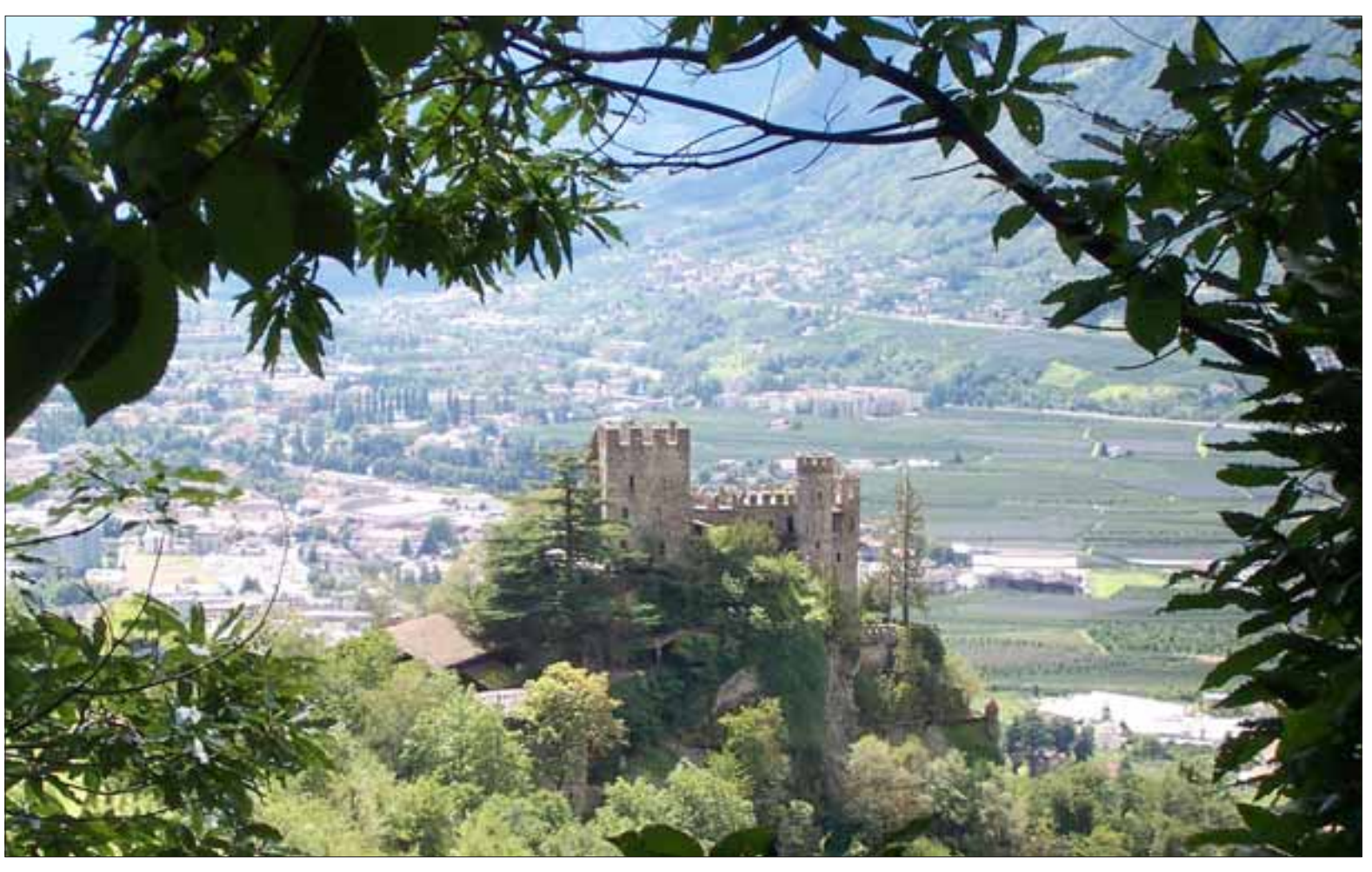
The spectacular view from the mountain sideTappeiner Promonade down across the valley floor towards the town of Merano.

Accommodations can be a bit expensive, but there are bargains to be found if you stay outside of the downtown area. One such place is Hotel Gruberhof (www.hotelgruberhof.com), a comfortable spot within walking distance of downtown with prices from 38 Euro per person with breakfast. The hotel also