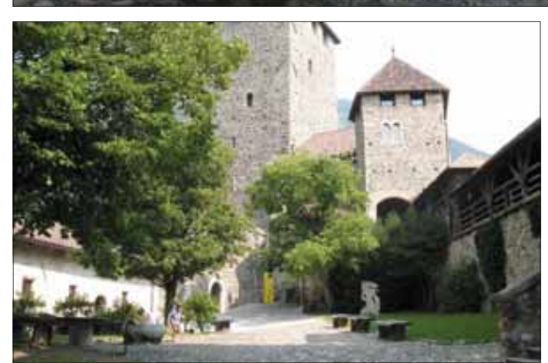
(Far left, top) The Castle Tyrol dominates the hilltop anove Merano. (Far left, bottom) The Passirio River flows through the valley and has a pleasant walkway along its banks.(Above) Children enjoy a refreshing drink from the well in the castle courtyard. (Left) The courtvard of the Castle Tyrol is fully accessable to enter.