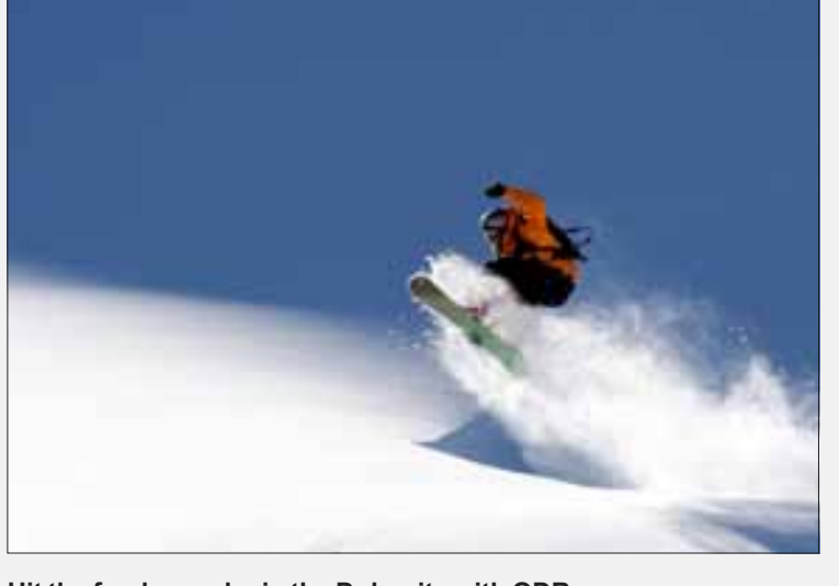
Hit the fresh powder in the Dolomite with ODR.

Visit the hill towns of Siena, San Gimignano and