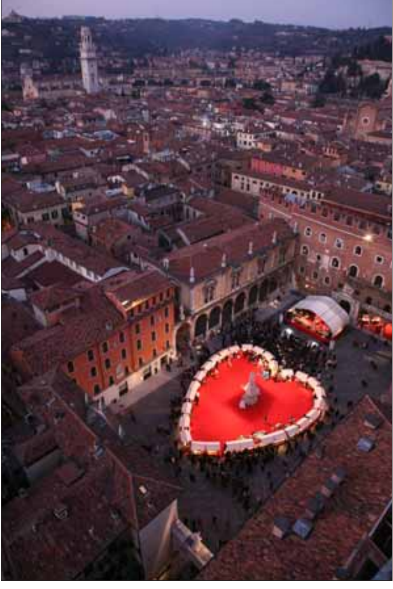
A Heart to Discover is featured in the marketplace of the Piazza di Signori in Verona on Valentine's Day Feb. 14 along with romantic gifts, crafts and live music.

Based on the "Dialogo nel buio" exhibition, it is held totally in the dark to intensify all the senses, especially touch. It offers a completely new "in the dark" experience in collaboration with the Milan Institute for the Blind. Admission fee: 5 euro.