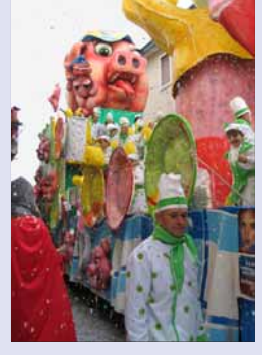
Many Italian carnevale celebrations feature parades of floats and costumed revelers such as this one in Malo.